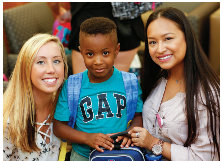
Student-led Backpacks to Brighten project gives school supplies to local children

Students participate in several organizations and community outreach projects to give back.