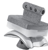
Salto Talaris Anatomic Ankle