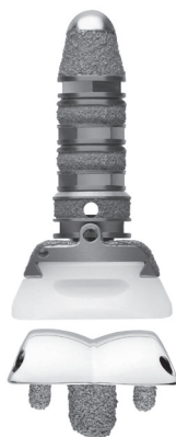
Inbone II Total Ankle

As part of your pre-surgery visit, your surgeon will explain your options in ankle replacement devices and determine the device best for you. Five most commonly used devices are pictured.