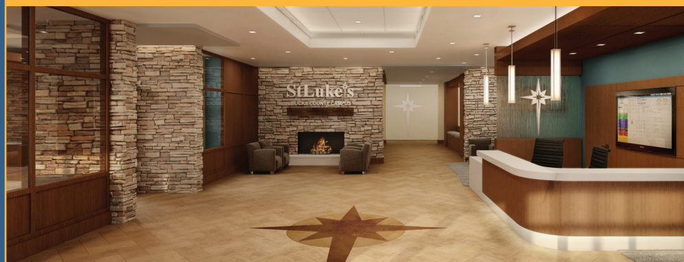
Rendering of main lobby

St. Luke's is developing a new 80-bed hospital on a 30-acre parcel of land at Route 663 and Portzer Road in Quakertown. With a total investment of $100 million, this new campus will be one of the largest development projects embarked upon in the history of the Quakertown region.