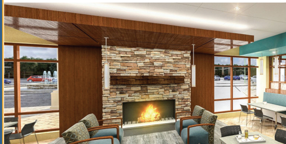
Rendering of cafeteria

The new location will include ample parking and is easily accessible to patients and their families. It is also close in proximity to many major manufacturers and local businesses and will be equipped to provide enhanced care and services to address the needs of major employers in the region.