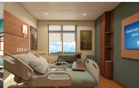
Rendering of patient room