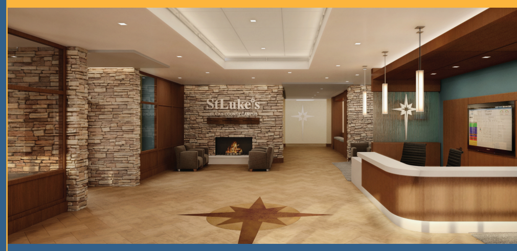
Rendering of main lobby

St. Luke's University Health Network is developing a new 80-bed hospital on a 30-acre parcel of land at Route 663 and Portzer Road in Quakertown. With a total investment of $100 million, St. Luke's Upper Bucks Campus will be one of the largest development projects embarked upon in the history of the Quakertown region.