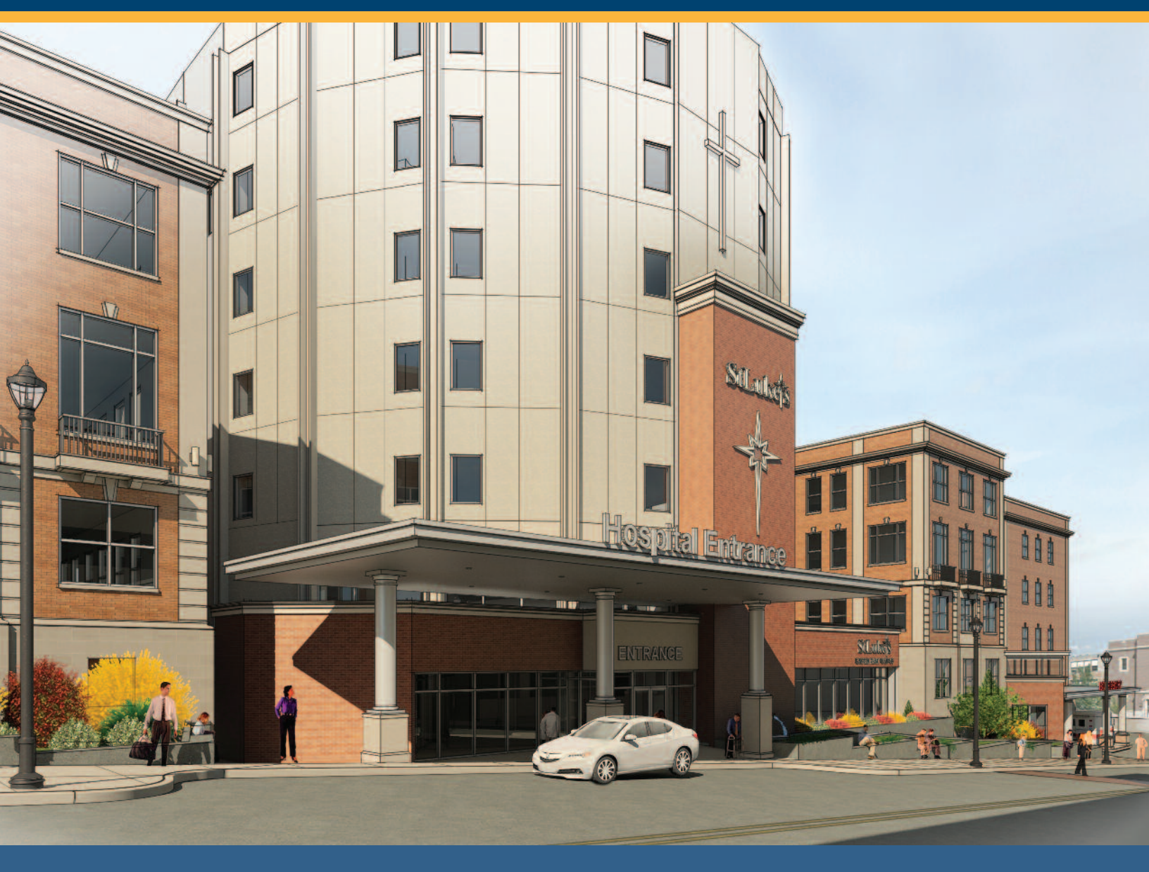
St. Luke's Sacred Heart Campus