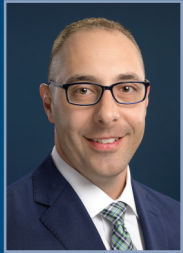
A Message from Our President

Geisinger Health System and St. Luke's University Health Network have joined forces to build an acute care hospital in Schuylkill County. This type of collaboration is the first of its kind in Pennsylvania, and Geisinger St. Luke's Hospital will be the first new hospital built in Schuylkill County in more than 90 years.